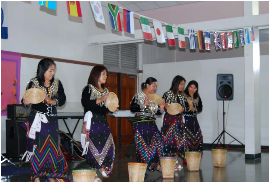
There were over 10 performances in their native costumes and dances: here is a troop of Burmese performers